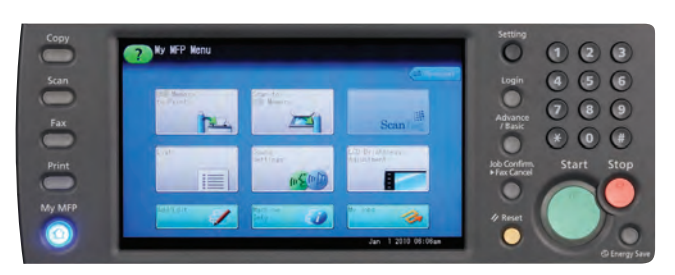
The MFX-2590 features an 8.5" color touch screen that quickly guides users through machine programming, job execution and troubleshooting. Using the illuminated keys on the control panel users can effortlessly toggle between modes, view job status, change settings, adjust the screen view and more.